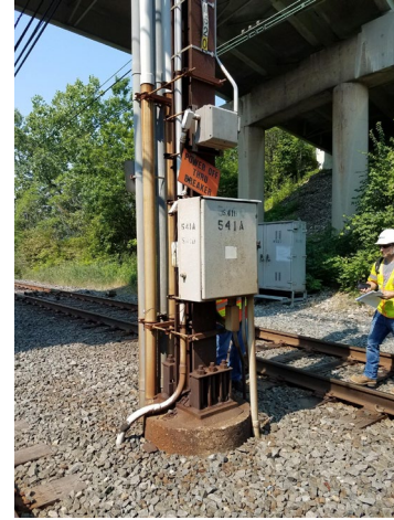
POLE WITH OBSTRUCTION