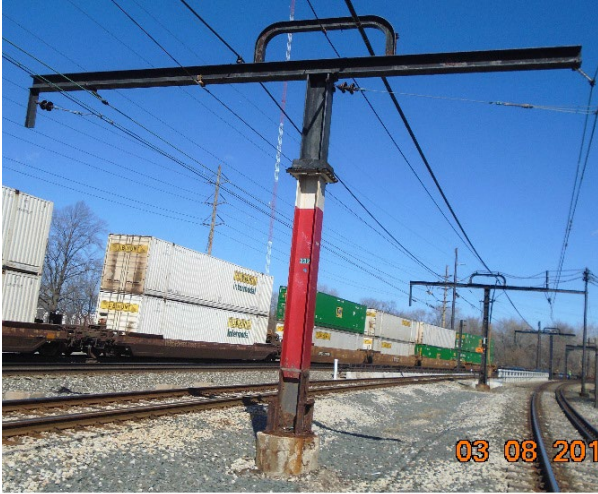
TYPICAL CATENARY POLE